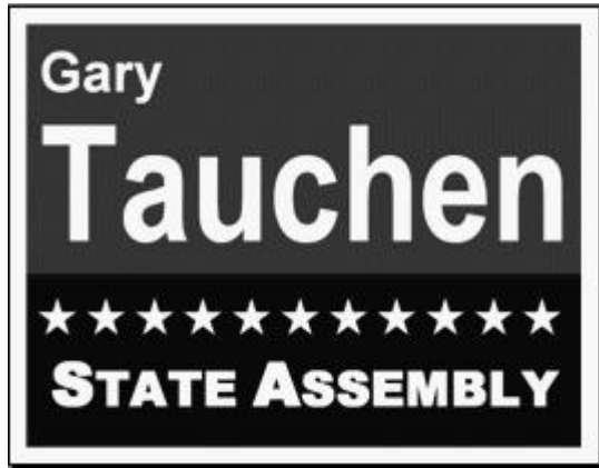
Page 2 – Window/Vehicle Sign