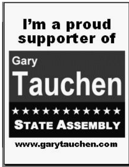
Page 3 – Supporter Sign