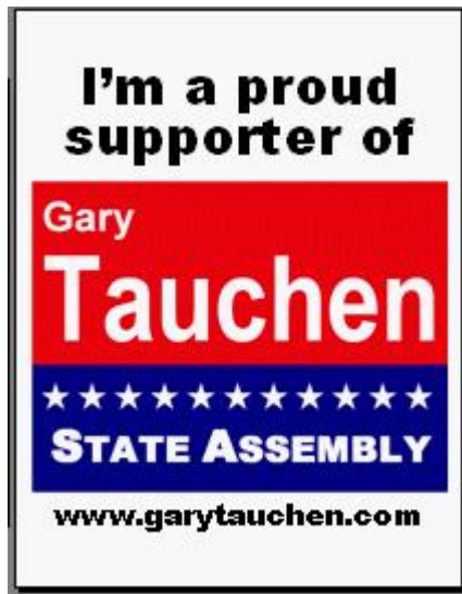
Page 3 – Supporter Sign