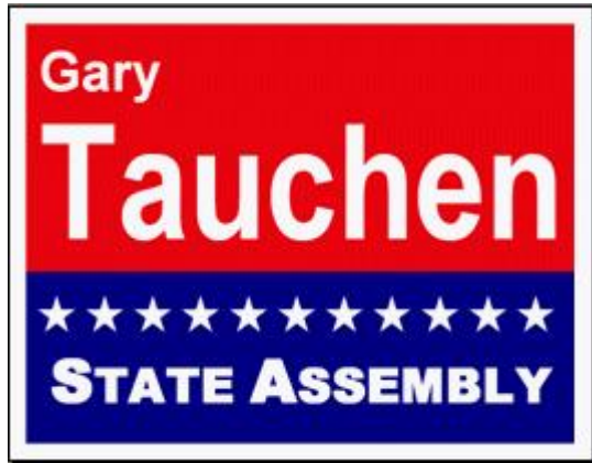
Page 2 – Window/Vehicle Sign